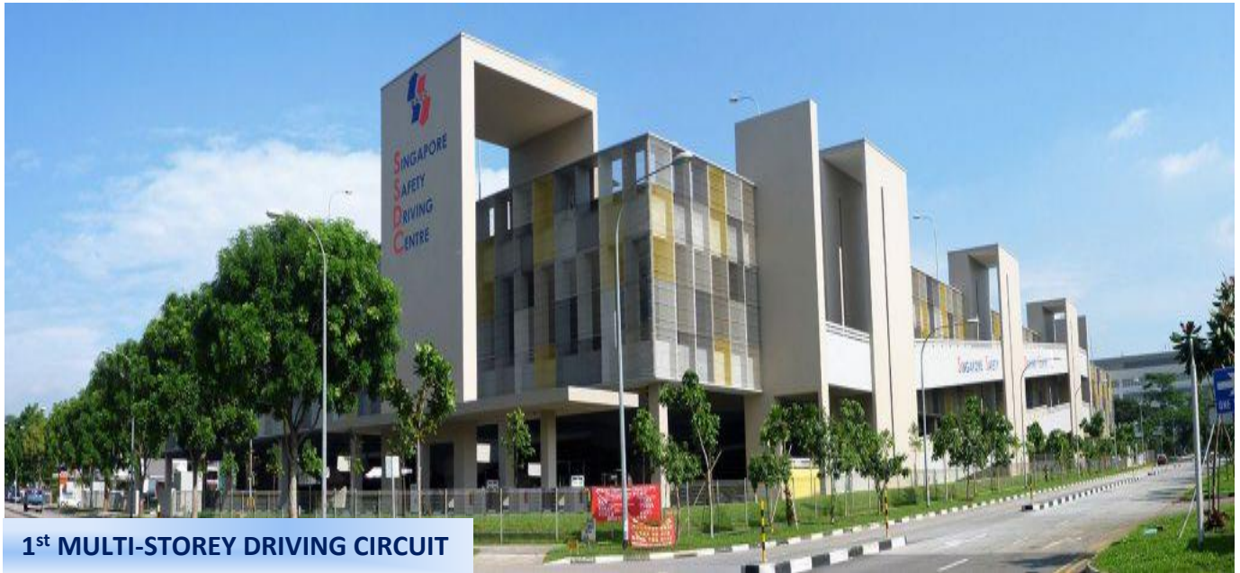
1 st MULTI-STOREY DRIVING CIRCUIT

A Good Road Safety Education Lasts A Lifetime