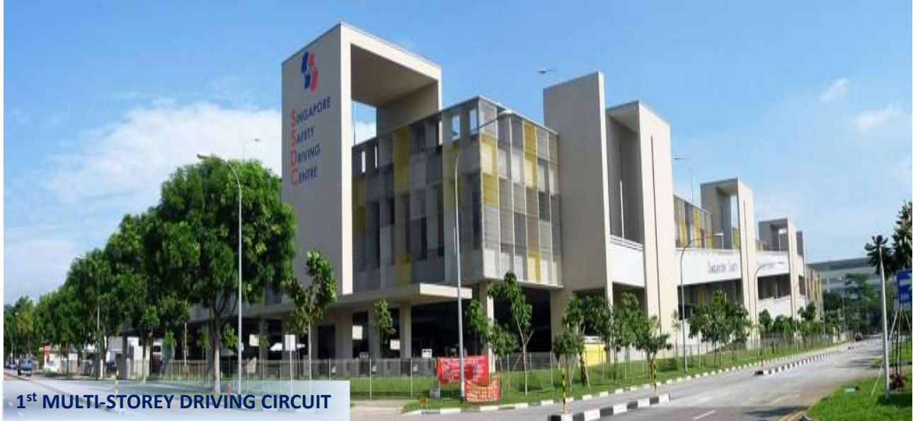
1 st MULTI-STOREY DRIVING CIRCUIT

A Good Road Safety Education Lasts A Lifetime